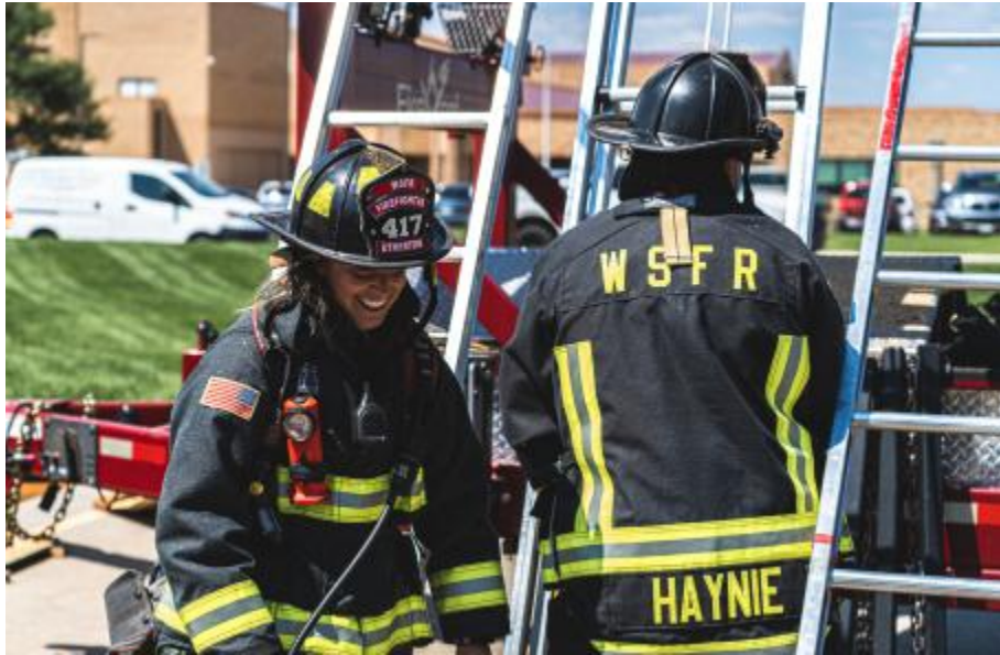
Firefighter Hiring Process