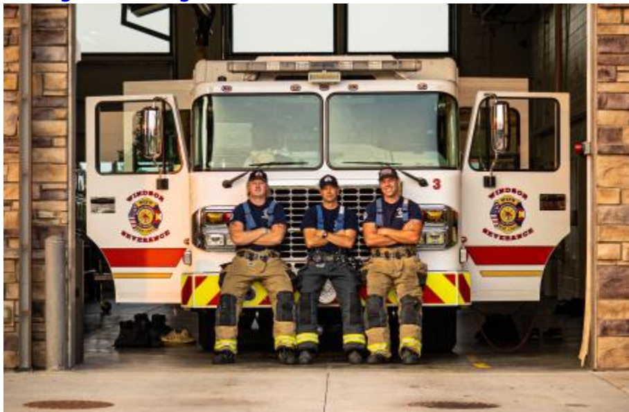
Compensation & Benefits