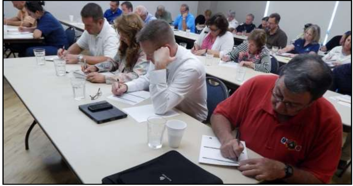
External Stakeholders Work Session