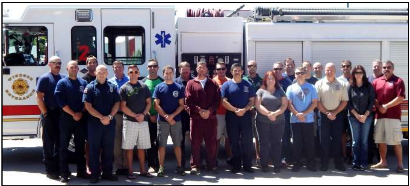
Internal Stakeholders Group