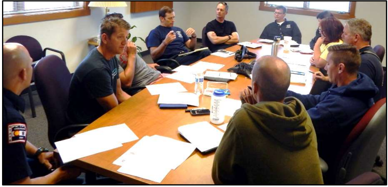
Internal Stakeholders Work Session