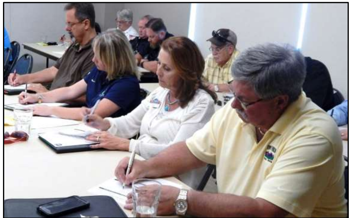
External Stakeholders Work Session