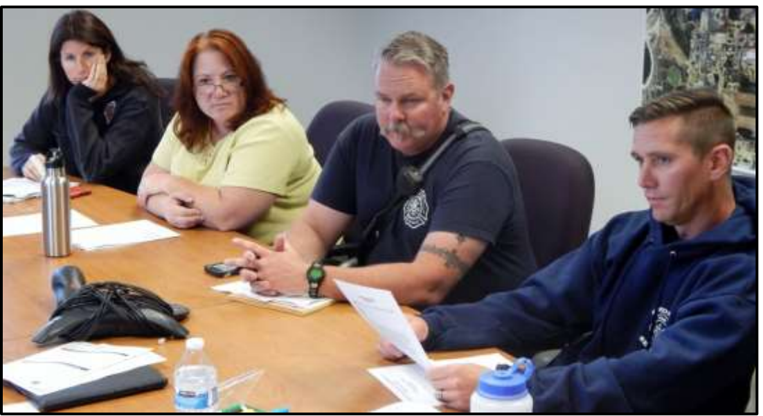
Internal Stakeholders Work Session